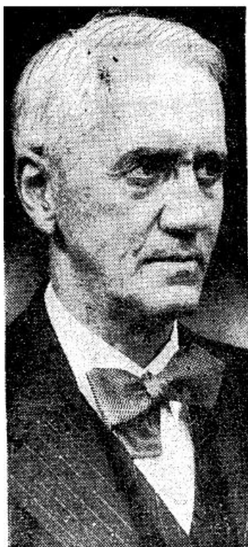
Sir Alexander Fleming