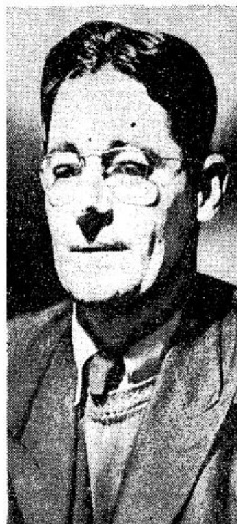
Sir Howard W. Florey 1944

Fleming received the 1945 Nobel Award for the discovery of penicillin, and Chain and Florey shared the prize for their contributions.