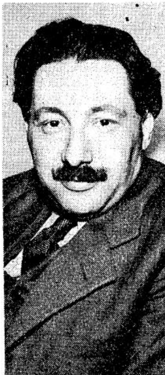
Dr. Ernst B. Chain